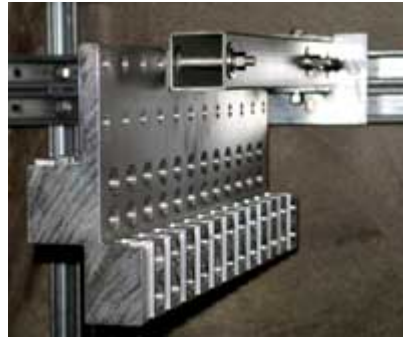
Close up of the 24 port connector

It takes a big fiberglass pedestal to handle today's large connectors. Nordic's ND-403264 secondary tap pedestal does the job. This large tap pedestal has enough depth to accommodate 4, 24 port 750MCM connectors. It's wide enough to stack four connectors in a diagonal fashion.