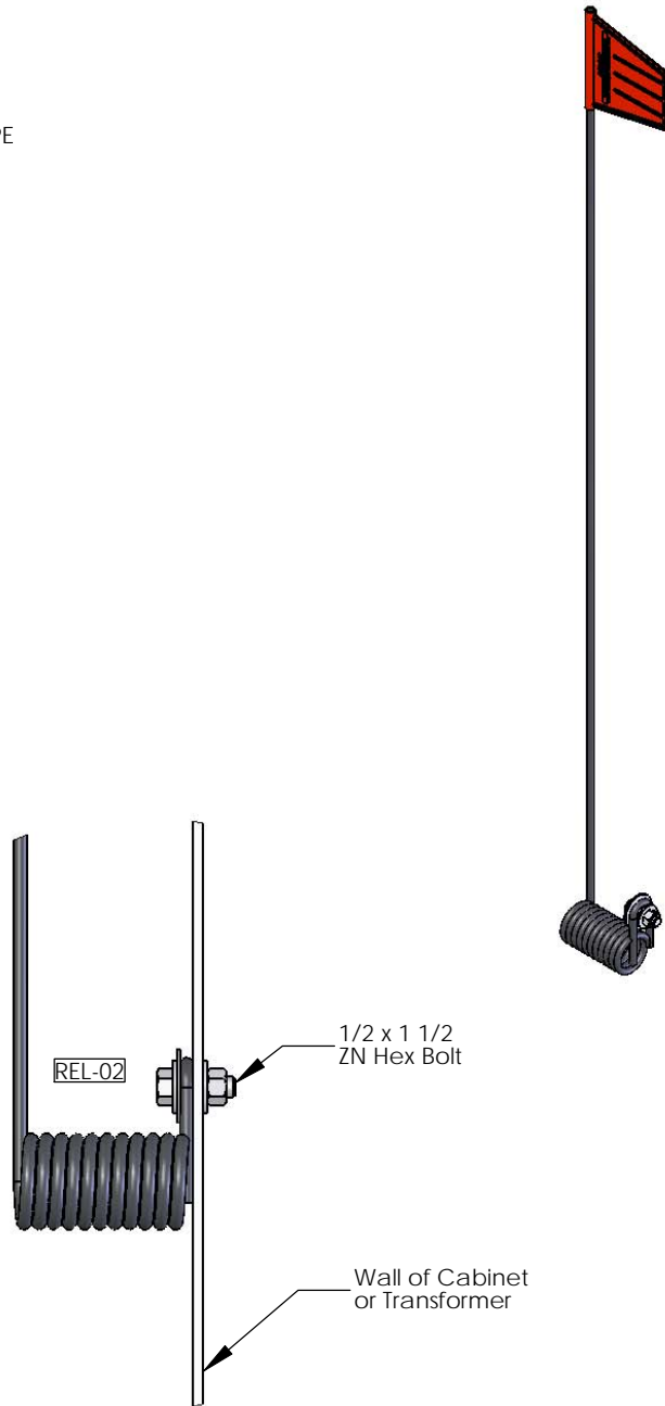
DETAIL A SCALE 1 : 5