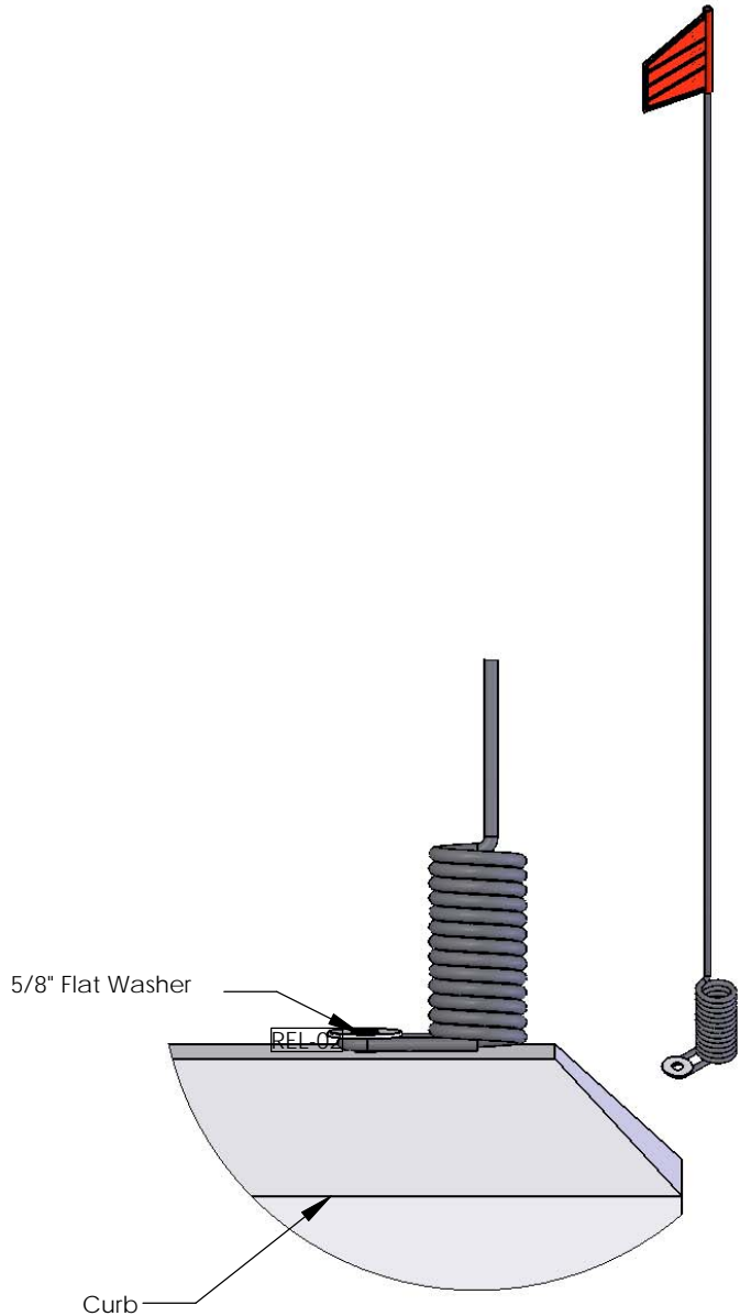
DETAIL A SCALE 1 : 5